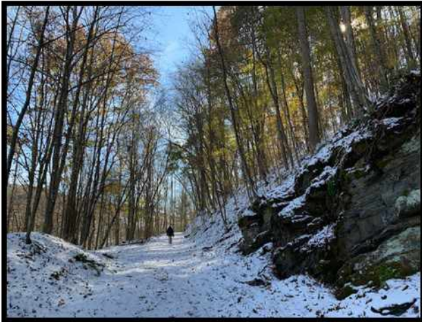
Above: Winter solitude

In each newsletter we will devote a page to share photos that highlight natural wonders encountered on the trail or recognize trail usage by individuals and groups such as scouts or hiking clubs. Remember to share your content on Facebook and Instagram as well. Please send your submissions to: info@MendotaTrail.org