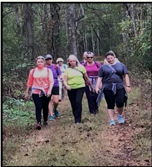
Below: Second Sunday Ramblers Hiking Club