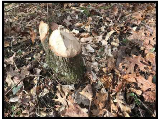
Beaver activity by Brian Penley