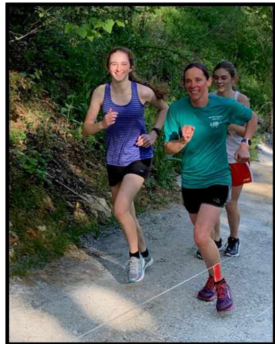
Enjoying the run!