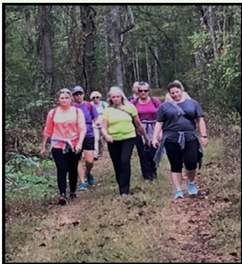
Below: Second Sunday Ramblers Hiking Club