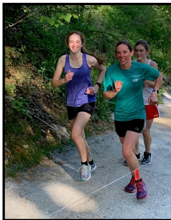
Enjoying the run!