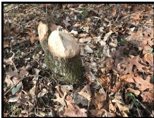
Beaver activity by Brian Penley