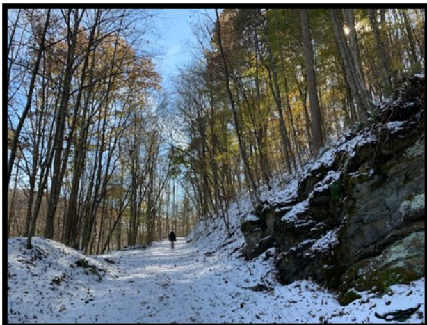
Above: Winter solitude

In each newsletter we will devote a page to share photos that highlight natural wonders encountered on the trail or recognize trail usage by individuals and groups such as scouts or hiking clubs. Remember to share your content on Facebook and Instagram as well. Please send your submissions to: info@MendotaTrail.org